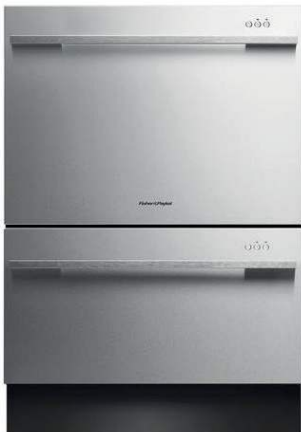
Figure 3: Fisher & Paykel Appliances DishDrawer™ dishwasher

Figures 3 and 4 show the Fisher & Paykel Appliances DishDrawer™ dishwasher. The two drawers allow smaller loads to be washed meaning water consumption and energy are reduced.