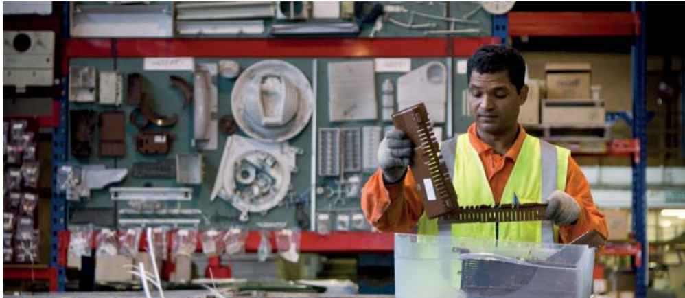
Figure 2: Fisher & Paykel Appliances employee taking apart their products at the end of its useful life

Figures 3 and 4 show the Fisher & Paykel Appliances DishDrawer™ dishwasher. The two drawers allow smaller loads to be washed meaning water consumption and energy are reduced.