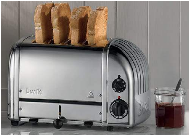
Figure 1: Original Dualit Toaster