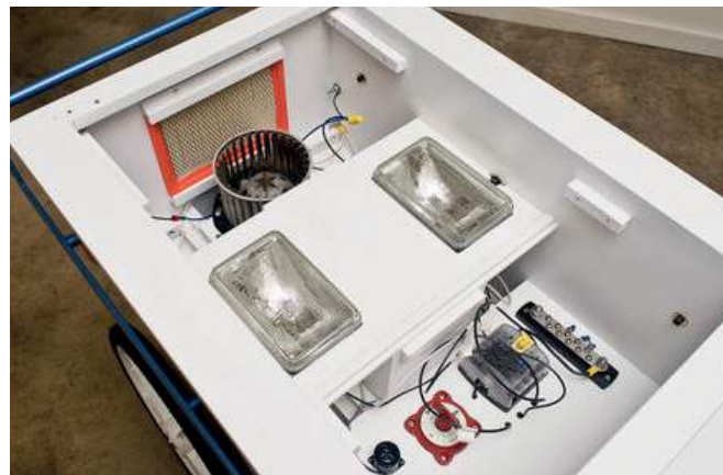
Figure 6: NeoNurture uses locally available car parts in its design and manufacture