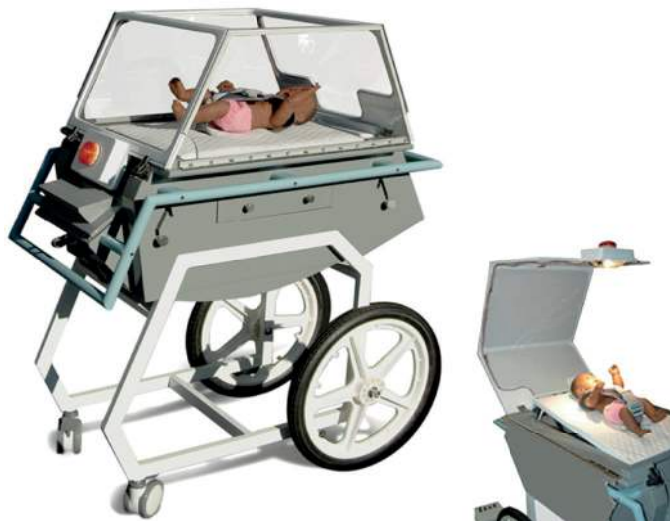
Figure 5: NeoNurture incubator